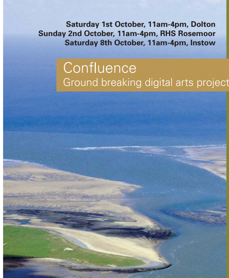
River Torridge.